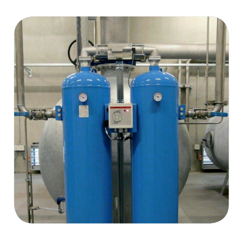
The control air is processed by two adsorption dryers.

CompAir's concept, which was implemented in the second half of 2013, involved the installation of five speed-regulated Quantima Q52 machines. Each machine is fitted with an electronically regulated 300 kW motor and supplies up to 50 m³/min of oil-free compressed air.