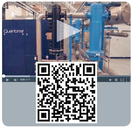
Video: https://www.youtube.com/watch?v=Dn4Z BNXCPiY&feature=youtu.be